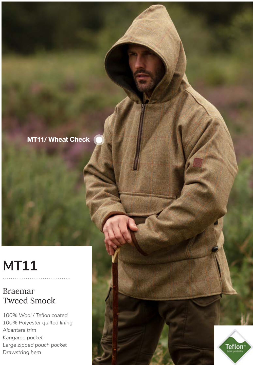
MT11/ Wheat Check