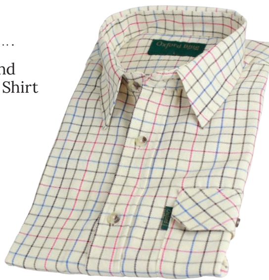
Red / Brown

50% Cotton/ 50% Polyester Yarn dyed Breast pocket with buttoned flap