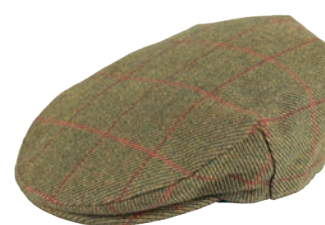
Dark Green 5907/51