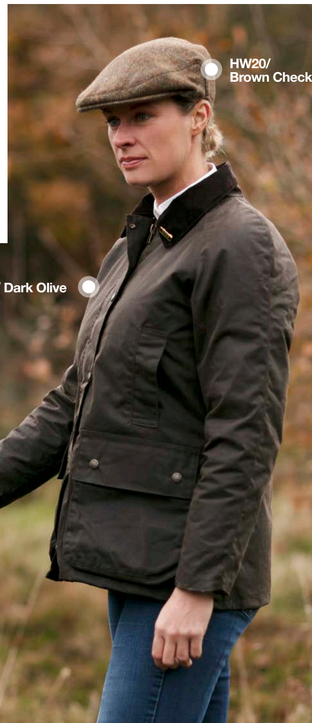
W09/ Dark Olive

Waxed cotton 100% Cotton quilted tartan lining Detachable hood Corduroy trim 2 Hand-warmer pockets 2 Bellows patch pockets 2 Way zipper Storm Cuffs