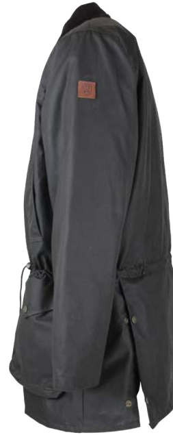
Brown Outer Jacket