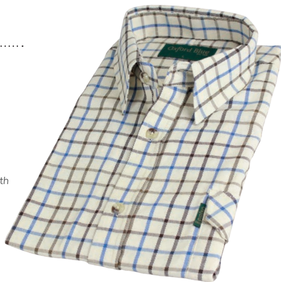
Brown / Blue

50% Cotton 50% Polyester Yarn dyed Breast pocket with buttoned flap