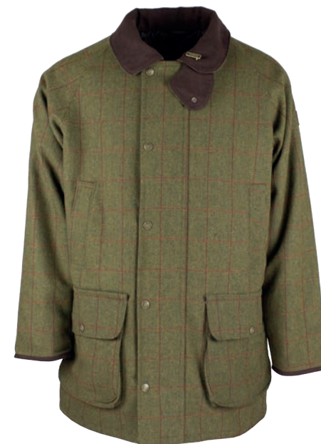
Dark Green (5907/51)

Sizes: S-3XL 60% Wool/40% Mixed Fibres 100% Polyester quilted lining Moleskin trim to cuffs and collar Breathable and waterproof taped seams drop liner 2 Way brass zipper 2 Bellows pockets 2 Hand-warmer pockets Pocket stay straps Storm cuffs