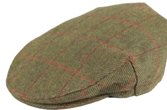
Dark Green 5907/51

Sizes: S-XXL 100% Wool 100% Polyester lining