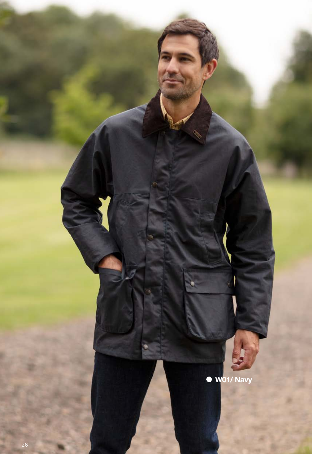
● W01/ Navy