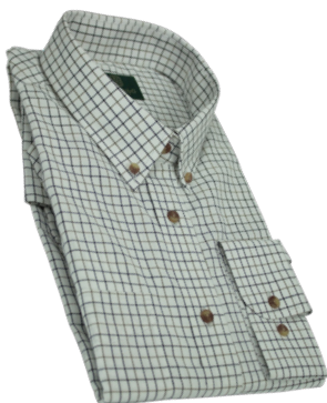
Black / Brown

Sizes: S-4XL 100% Cotton Yarn dyed Button down collar Breast pocket