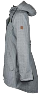
Prince of Wales Check