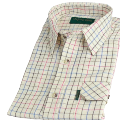
Red / Brown

Sizes: S-3XL 50% Cotton/ 50% Polyester Yarn dyed Breast pocket with buttoned flap