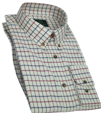
Navy / Red

Sizes: S-4XL 100% Cotton Yarn dyed Button down collar Breast pocket