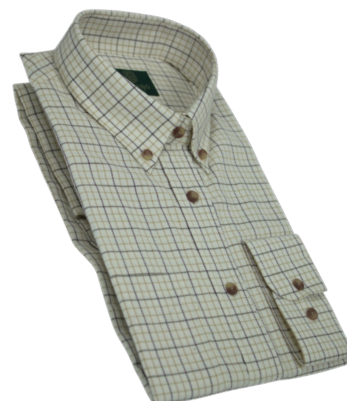
Brown / Yellow

Sizes: S-4XL 100% Cotton Yarn dyed Button down collar Breast pocket