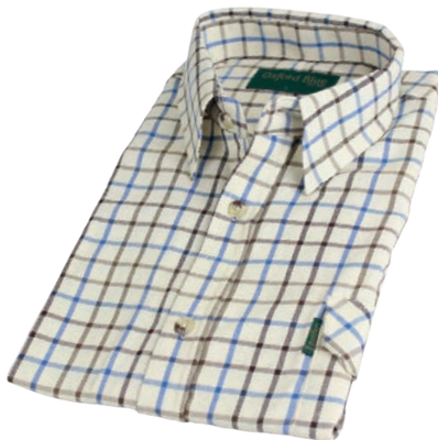
Brown / Blue

Sizes: S-3XL 50% Cotton 50% Polyester Yarn dyed Breast pocket with buttoned flap