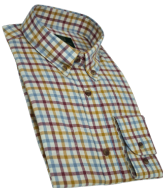
Red / Orange

Sizes: S-4XL 100% Cotton Yarn dyed Button down collar Breast pocket