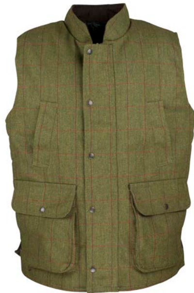
Dark Green (5907/51)