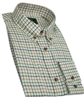
Orange / Green

Sizes: S-4XL 100% Cotton Yarn dyed Button down collar Breast pocket